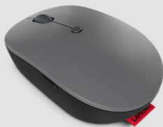
Lenovo Go USB-C Wireless Mouse PN: 4Y51C21216

Designed to complement the lifestyle of ultrabook users, the Lenovo Go USB-C Wireless Mouse is crafted for superior portability and comfort. With a blue optical sensor that works on most surfaces and USB-C connectivity, it is ready to thrive in a dynamic workplace. Its ultra-long battery life and programmable utility button ensure it is capable of any task and ready to be used at a moment's notice.