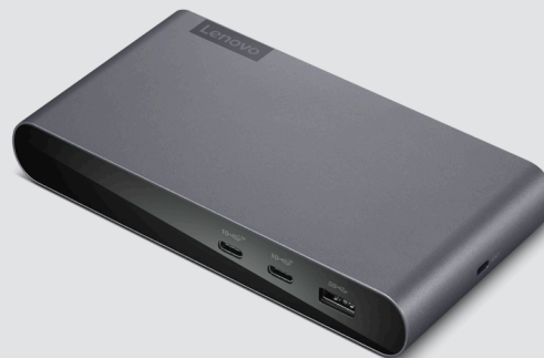
Lenovo USB-C Universal Business Dock PN: 40B30090XX

Designed to complement the lifestyle of ultrabook users, the Lenovo Go USB-C Wireless Mouse is crafted for superior portability and comfort. With a blue optical sensor that works on most surfaces and USB-C connectivity, it is ready to thrive in a dynamic workplace. Its ultra-long battery life and programmable utility button ensure it is capable of any task and ready to be used at a moment's notice.