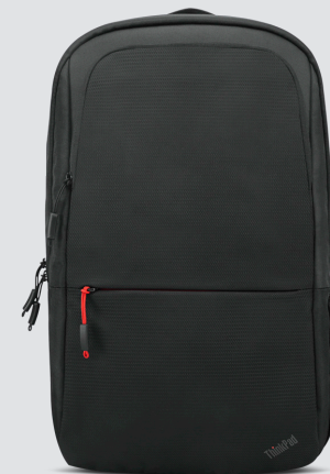
ThinkPad Essential 16-Inch Backpack (ECO) PN: 4X41C12468

Designed for modern professionals, the Lenovo USB-C Universal Business Dock has everything that helps boost your productivity to the next level. With enhanced port expansion, optimum power delivery and dual display support in a small space saving stylish exterior, the dock is the perfect companion for hybrid workspaces. The Lenovo USB-C Universal Business Dock is designed with style and substance in a sleek storm grey exterior with premium matte texture.